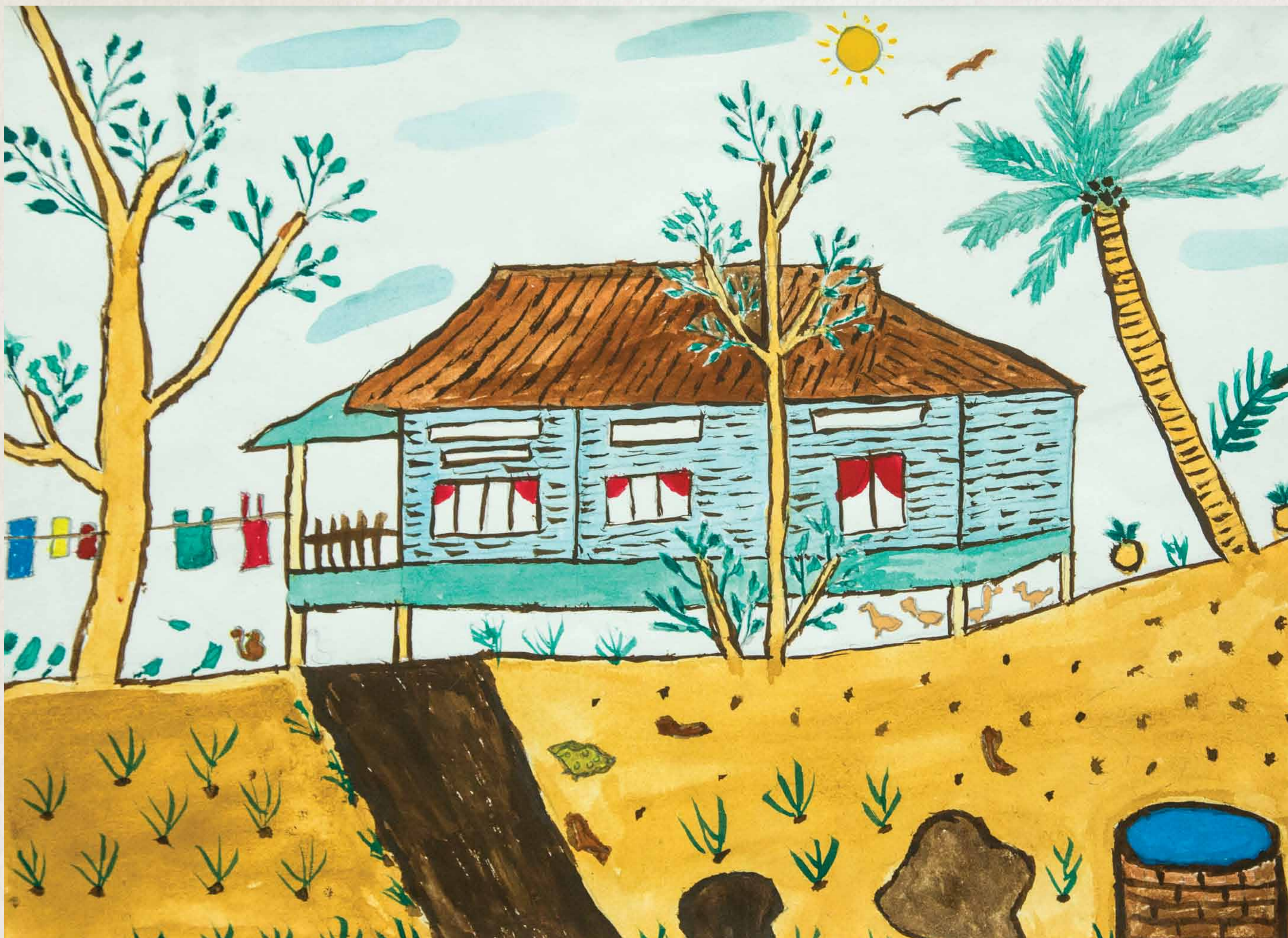
甘榜情 Back To The Kampung Days